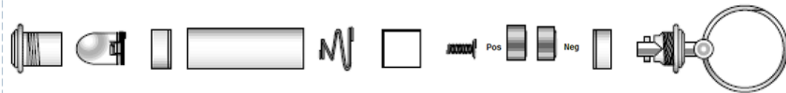
Diagram A / Parts Layout